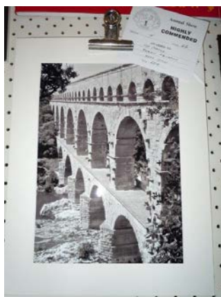
Lyn Cornish – Historical Place of Interest