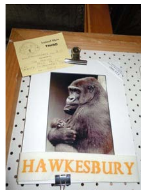
Tim Hodson – Tribute to Mother's Day