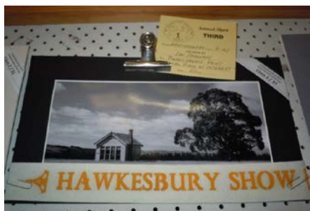
Ian Cambourne – Local Place of Interest