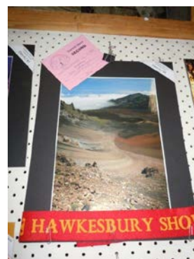
Ian Cambourne – Landscape