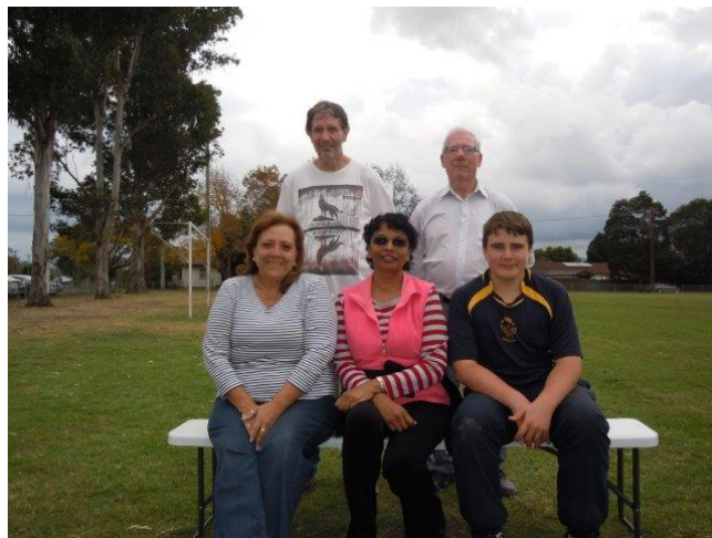
The team at the end of the day