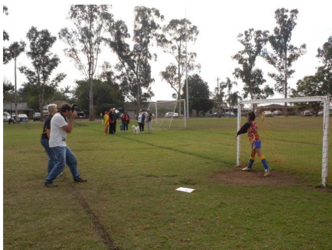
Photographer in action!!