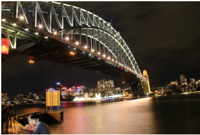
Check out the couple taking a 'selfie'!!