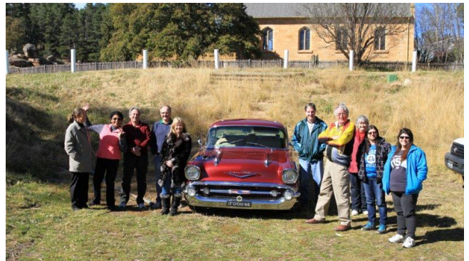
Morning tea break –Hartley Historic Village