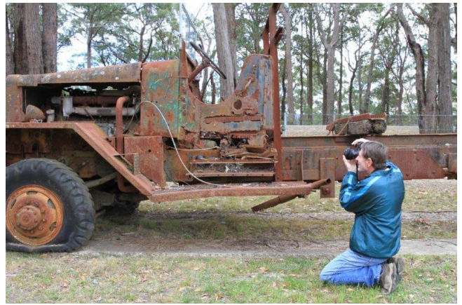
Trying to get that right angle...