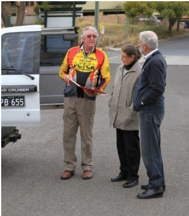
Richmond Club Car-park – Photo Rally Starting Point