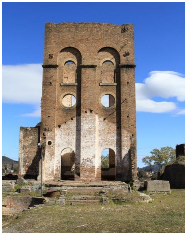
Blast Furnace Park - Lithgow