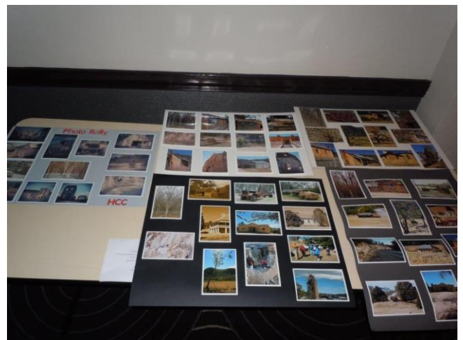
Some presented collage