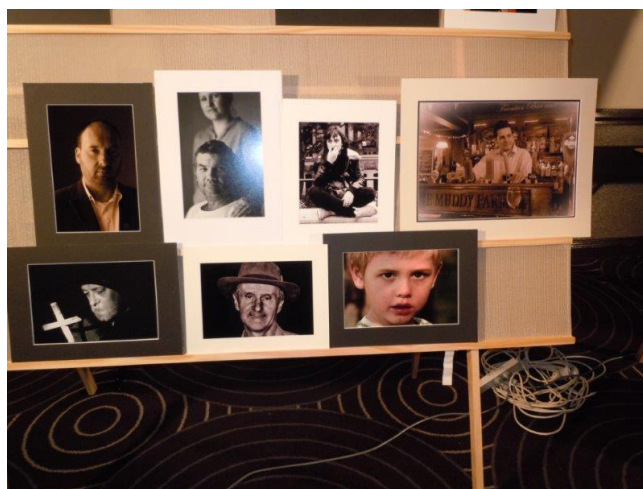
Winning photograph and the 6 selections on the night