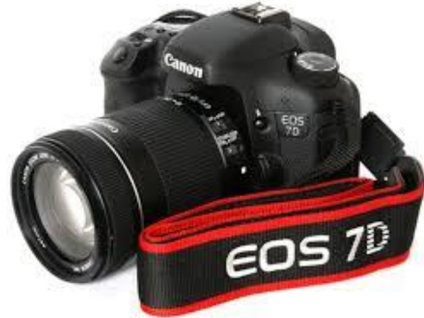
PHOTO RALLY WINNERS