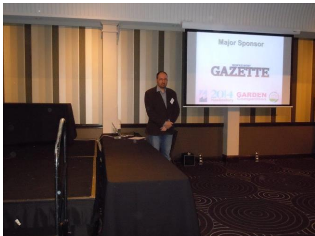
Our Web Master looking so smart