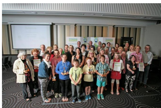
2014 Hawkesbury Garden Comp - Happy winners