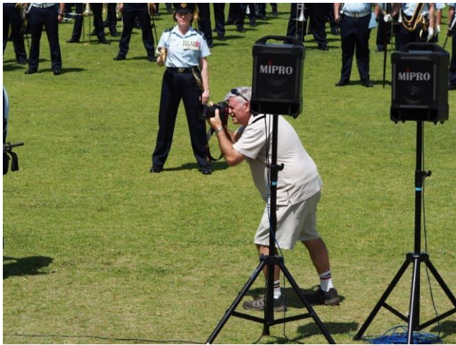
Look who's in action on the day!!