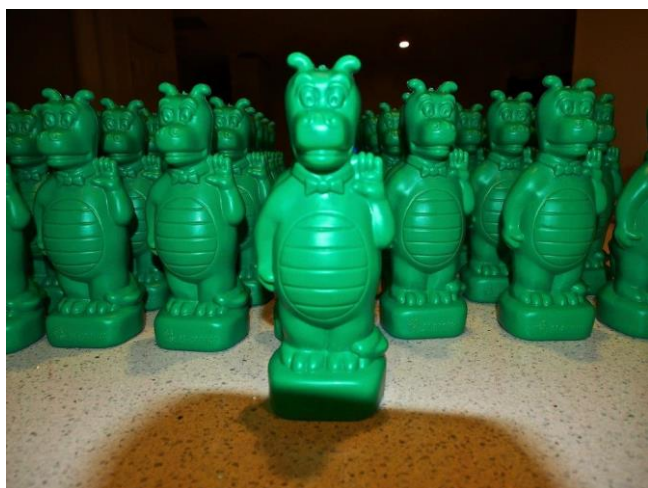
Oh those green dragons!!

The Camera Club Committee wish to extend its appreciation and thanks to those members who participated in giving a helping hand during the presentation evening.