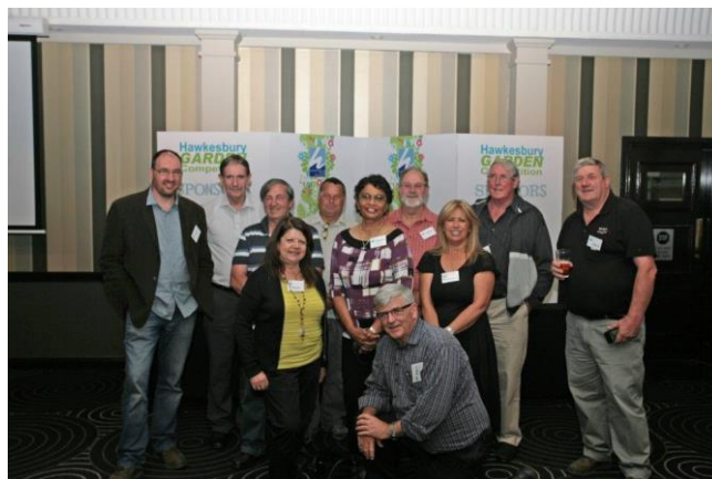
Camera Club supporters and volunteers on the day