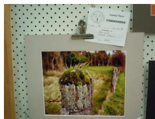
Don Clay - Commended Landscape