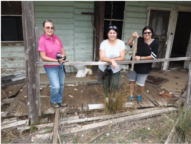
Eugowra accommodation with Carpet Snake