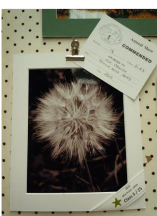
Lyn Cornish - Commended Mini Print