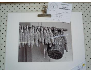
Lyn Cornish - Highly Commended Farm Life