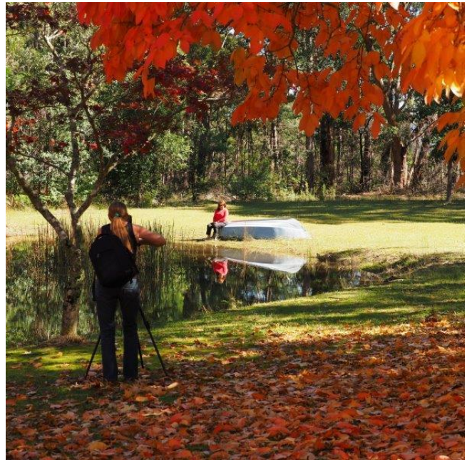
The Mill Paddock-Mountain Lagoon