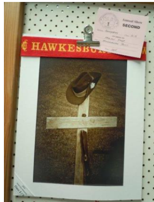
Marian Paap - 2 nd Place Anzac Day Memories