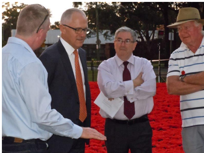
Look who I bumped into...