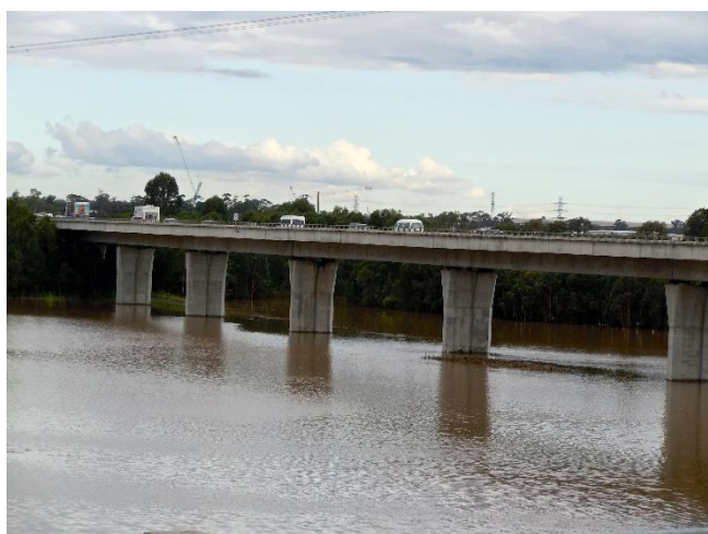
Hawkesbury Valley Way