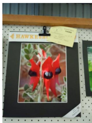
Tim O'Brien - 3 rd Place Botanical theme