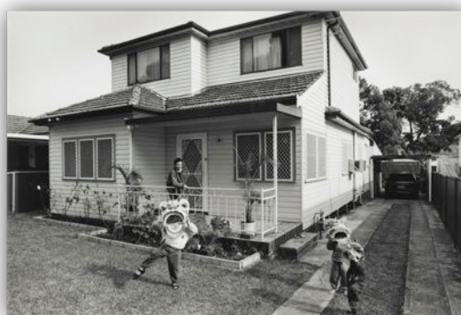
Children with Chinese New Year dragon masks and their father, Auburn, 1998