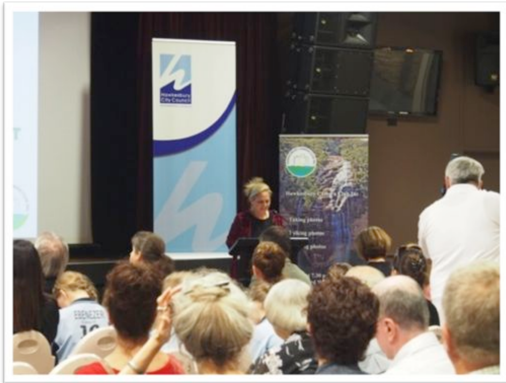
The new Mayor's speech