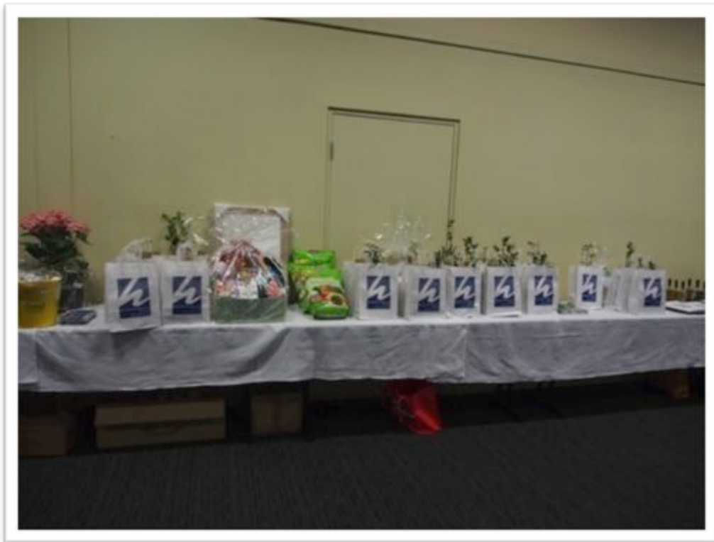
Trophies and Prizes are setup and ready to go!!

Thanks to all the members attended on the presentation evening to support and represent the Camera Club and especially for those who volunteered to take on the tasks behind the scenes and on the day to make this a successful evening. Everyone looked great in Club polo shirts.