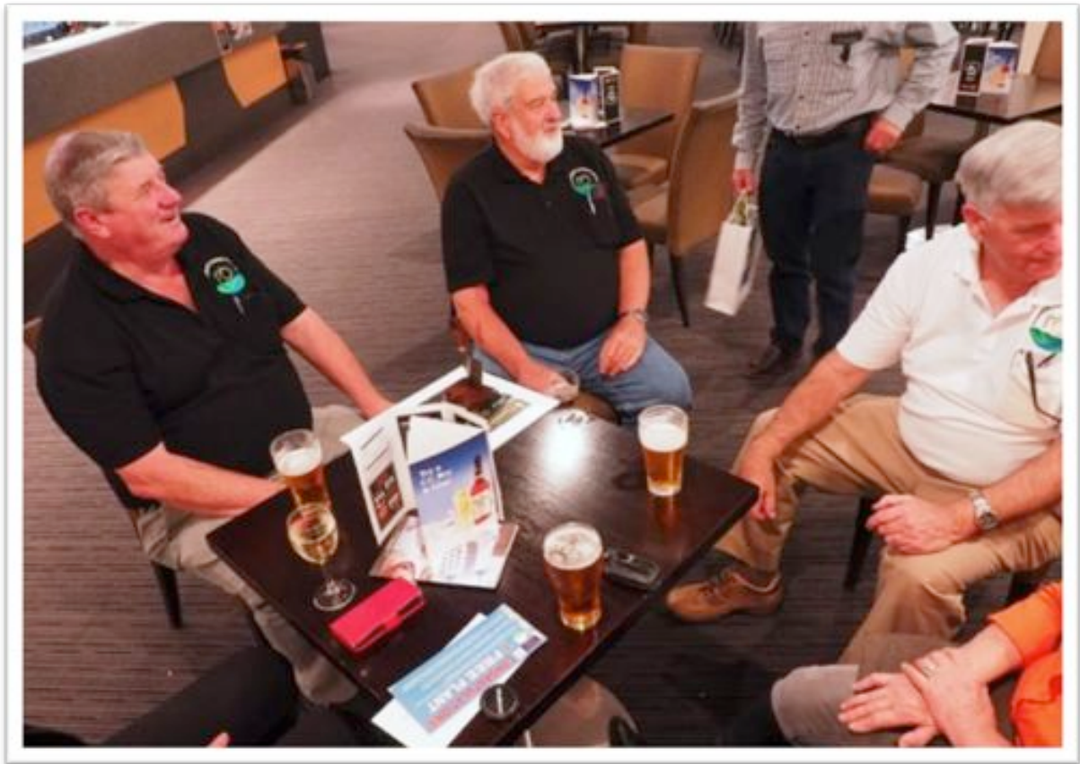
Well earned drink and nicely dressed too!!