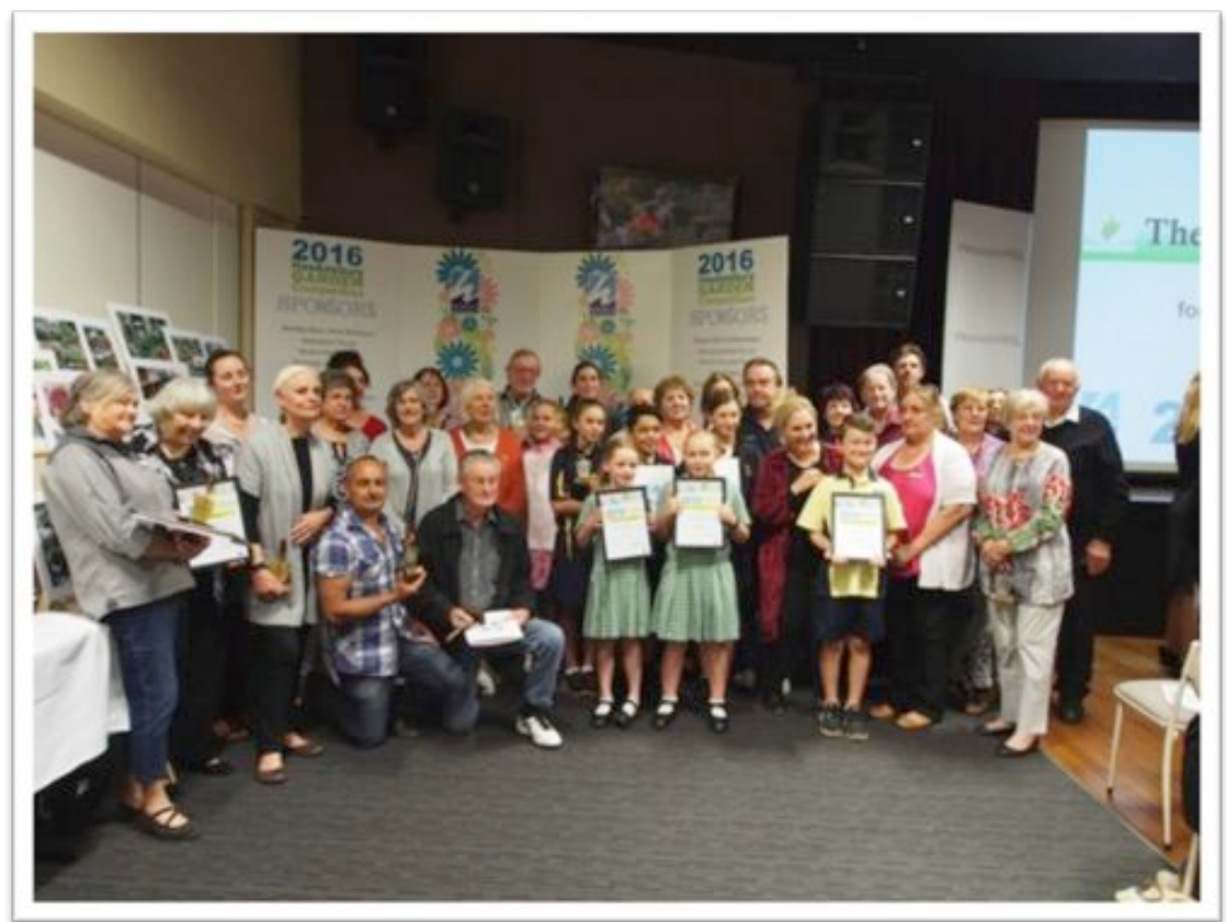
The Garden Comp winners - congratulations